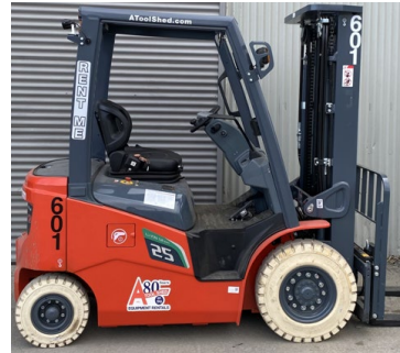
Battery Powered Warehouse Forklift